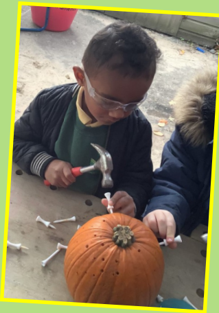
Ash and Elm have had fun exploring pumpkins! @thrivetrust_UK